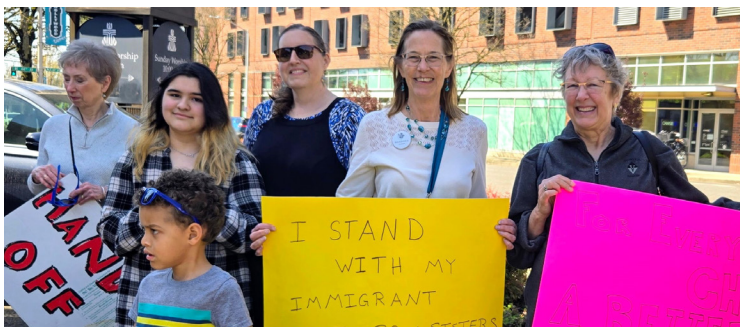
St. Michael & All Angels 2025 Annual Report

A good share of your funds stayed closer to home, with donations to those groups assisting immigrants and undocumented residents. Donations went to Viva Inclusive Migrant Network, PDX Immigration Rights Oregon, Pueblo Unido, Innovation Law Lab, and IMIRJ. Donations also went to those in Portland who are unhoused or food-insecure, such as to the NW Pilot Project, We Shine, and Cultivate Initiatives. And we remembered the best friends of the houseless with a donation to PAWS, which furnishes vet care and supplies.