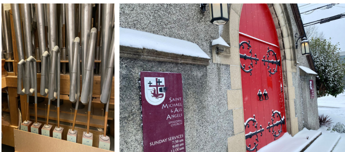
St. Michael & All Angels 2025 Annual Report

In 2025 we had just over $28,000 in new grant monies in addition to over $26,000 in undisbursed funds from the prior three years available. As a result, we were able to approve seven grant requests for a record annual total amount of over $41,000 in each of the above categories as follows: