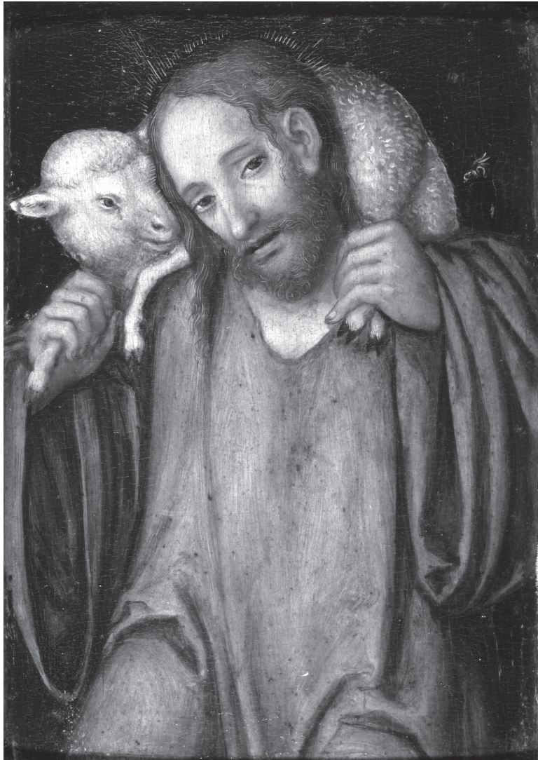
Christ as the good shepherd, Lucas Cranach, ca. 1540

THE FOURTH SUNDAY OF EASTER EARTH DAY APRIL 21, 2024