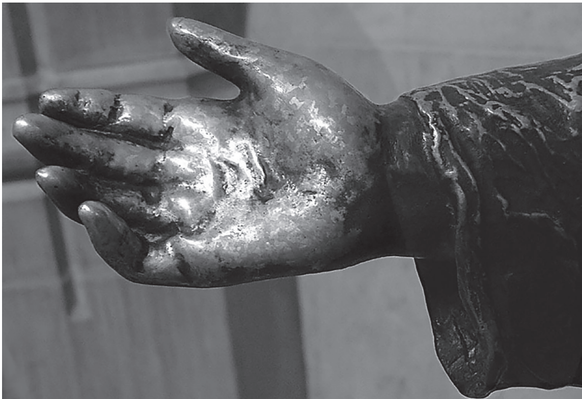
Jesus' hand reaches out to the children, Washington National Cathedral