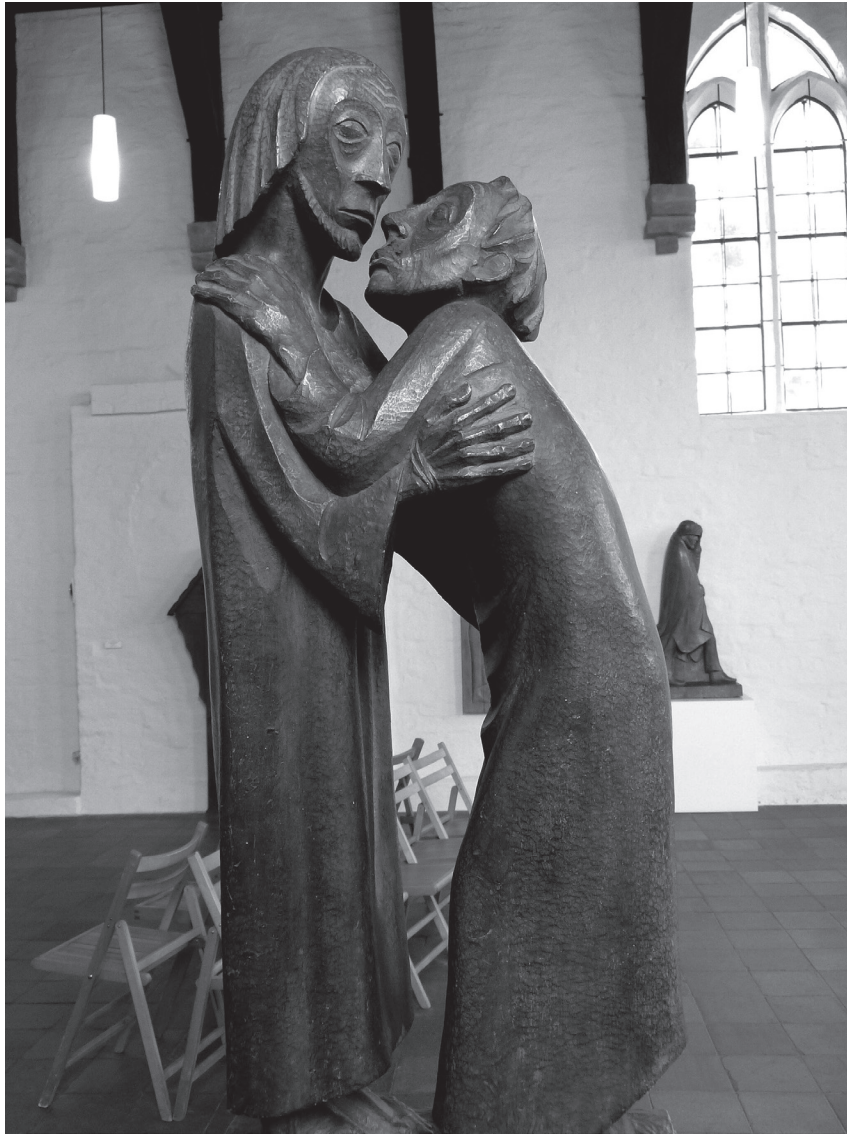
Reunion - Thomas and Christ, France. Ernst Barlach, 1926