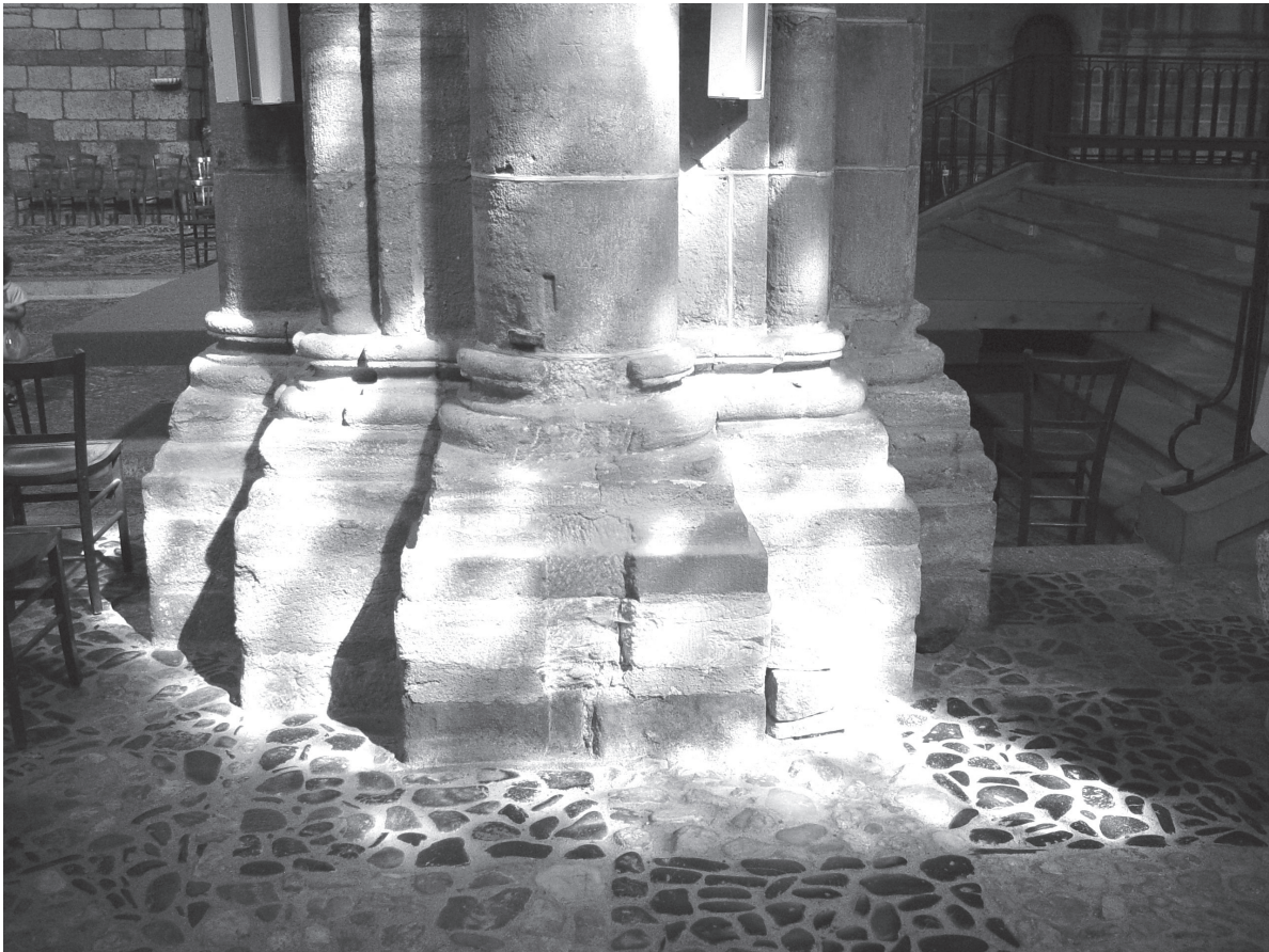
Light bathes the interior of Saint-Julien in Brioude, France., 1075-1125

THE FOURTH SUNDAY IN LENT MARCH 10, 2024