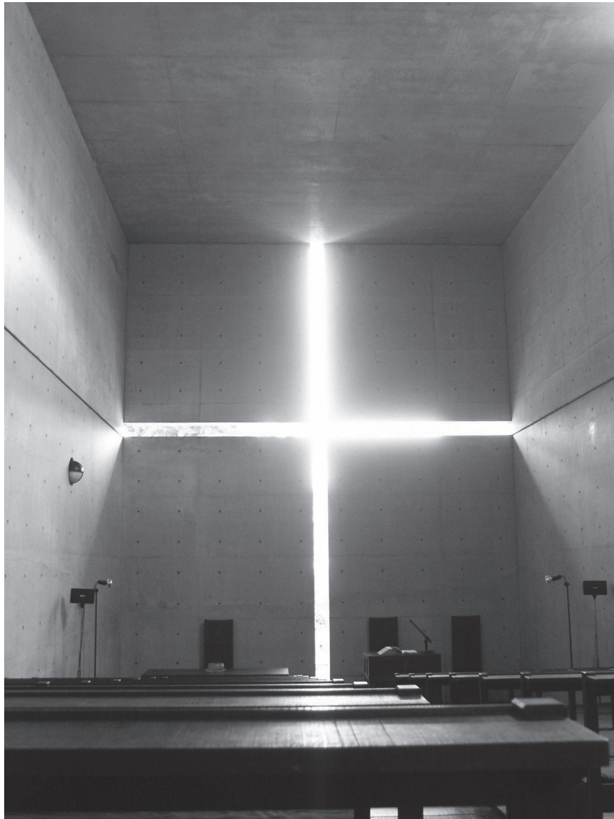
Interior of the Church of the Light, Tadao Andō, 1999

THE FOURTH SUNDAY IN LENT MARCH 10, 2024