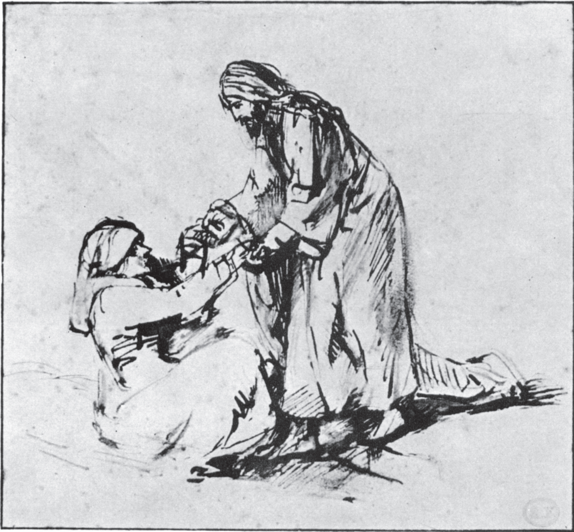
Christ Healing Peter's Mother-in-Law, Rembrandt van Rijn, 17th century

THE FIFTH SUNDAY AFTER THE EPIPHANY FEBRUARY 4, 2024