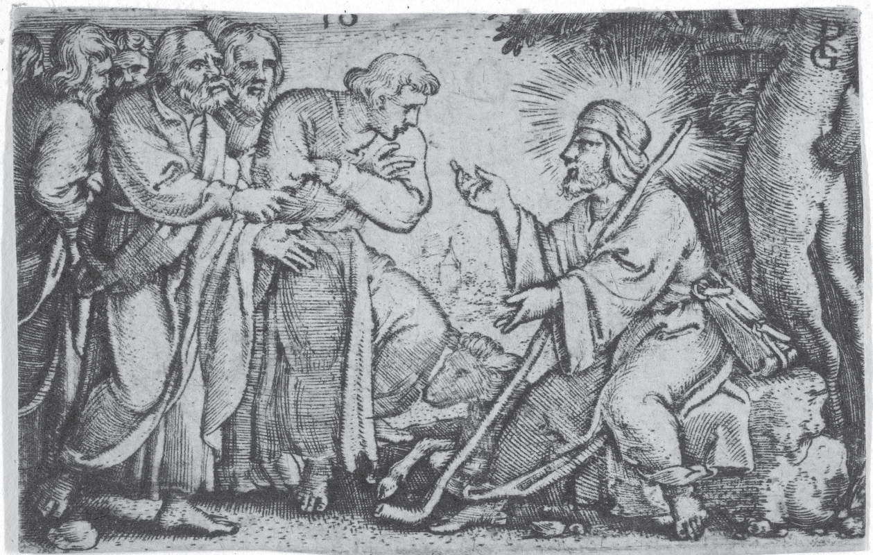
Christ Speaking With the Disciples, Georg Pencz, 1534–35

THE FIFTH SUNDAY AFTER THE EPIPHANY FEBRUARY 4, 2024