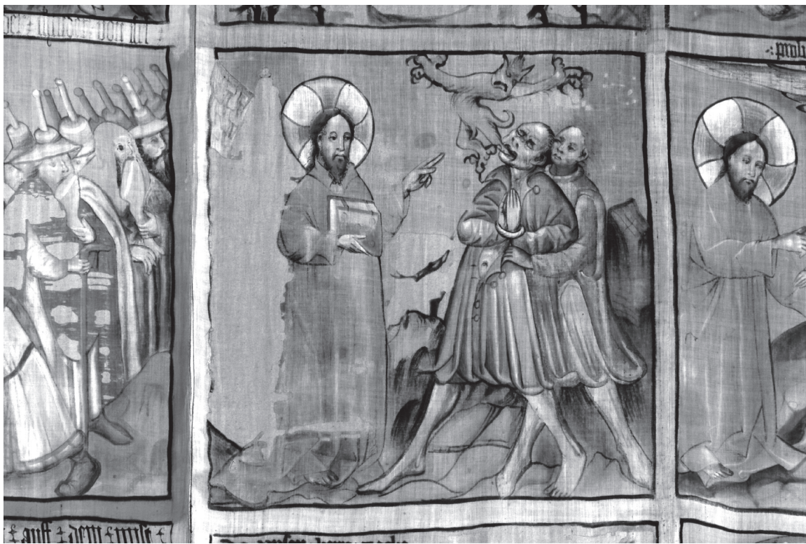
Jesus Casts Out the Unclean Spirit, Konrad von Friesach, ca. 1450

THE FOURTH SUNDAY AFTER THE EPIPHANY JANUARY 28, 2024