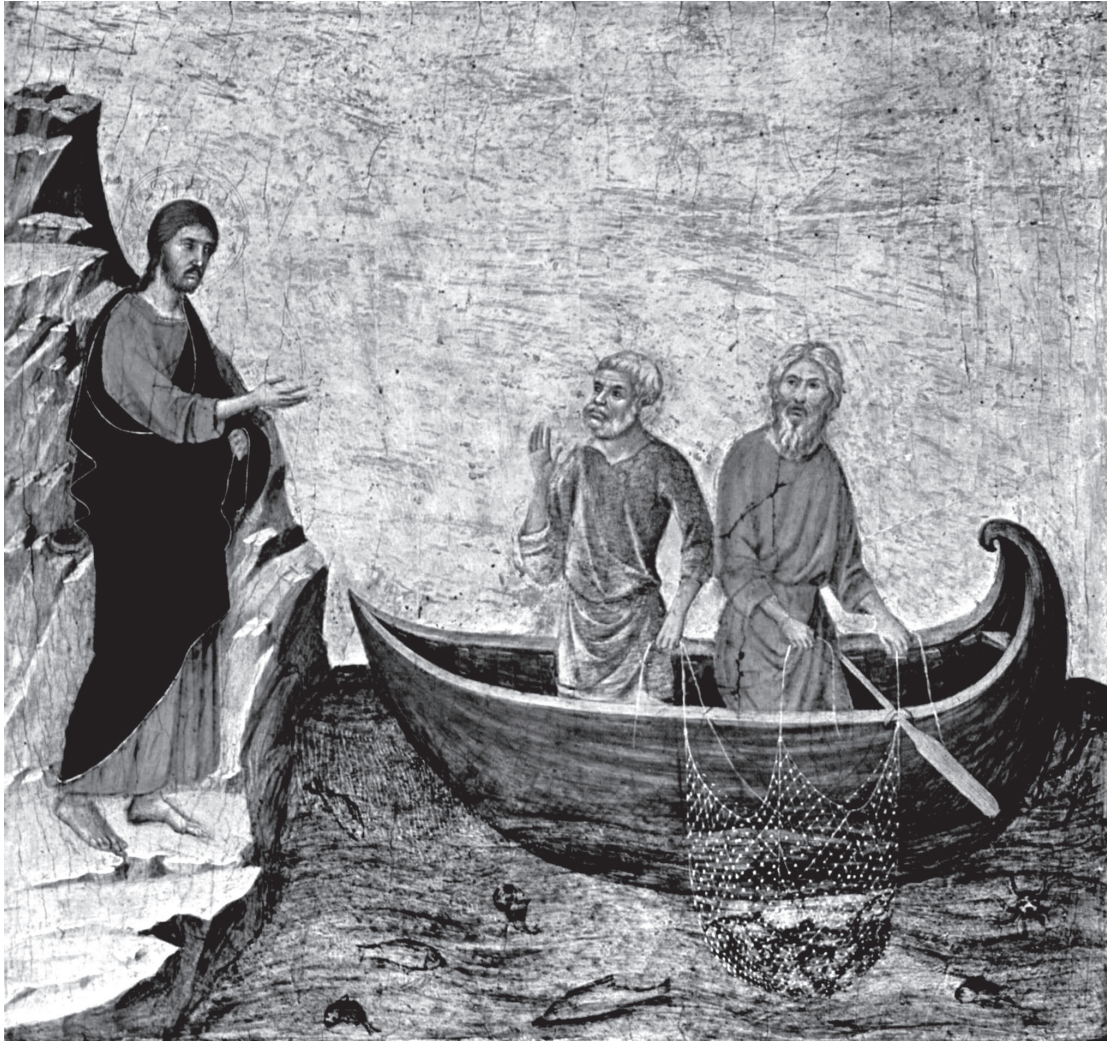
Christ Calling the Apostles Peter and Andrew, Duccio, di Buoninsegna, 1319

THE THIRD SUNDAY AFTER THE EPIPHANY JANUARY 21, 2024