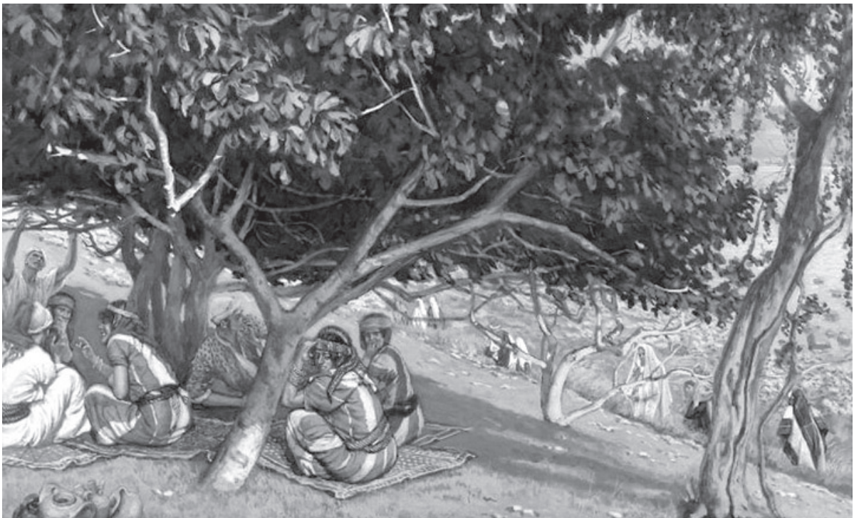
Nathanael Under the Fig Tree, James Tissot, 1886-1894

THE SECOND SUNDAY AFTER THE EPIPHANY JANUARY 14, 2024