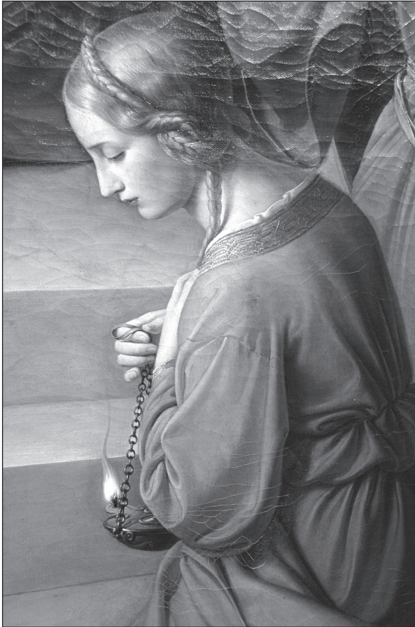
Parable of the Wise and Foolish Virgins, Friedrich Wilhelm von Schadow, 1838-1842

THE TWENTY-FOURTH SUNDAY AFTER PENTECOST NOVEMBER 12, 2023