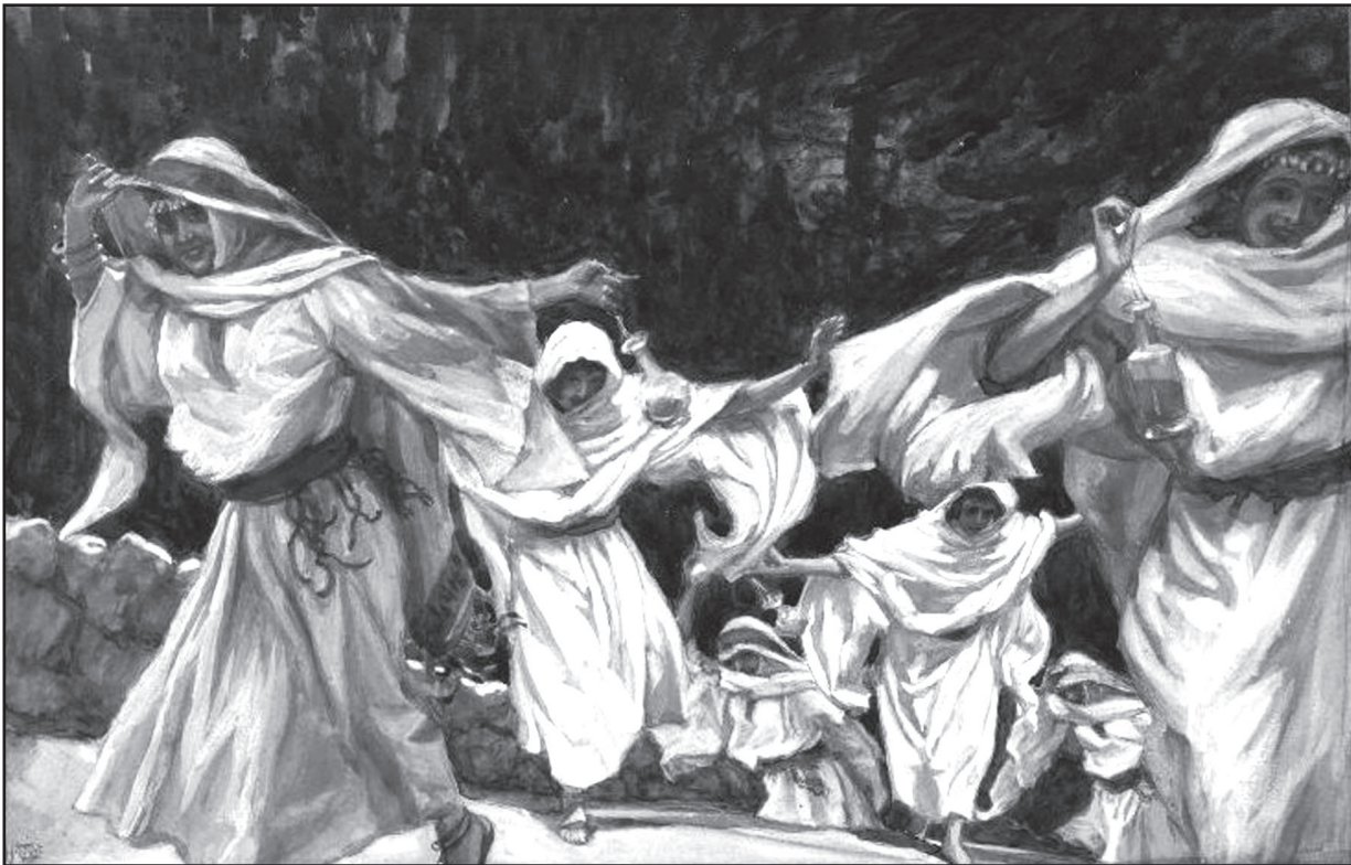
Foolish Virgins, From the Substance, James Tissot, 1886-1894

THE TWENTY-FOURTH SUNDAY AFTER PENTECOST NOVEMBER 12, 2023