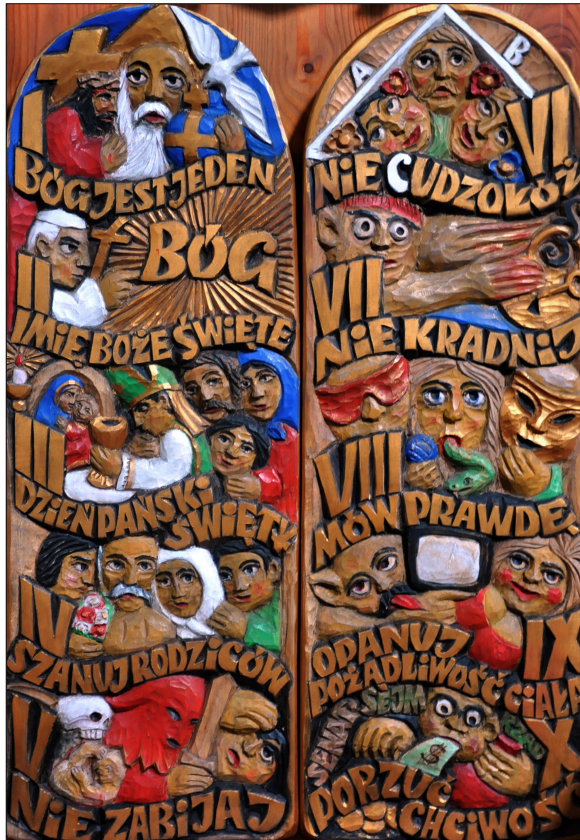
Ten Commandments, illustrative wood relief carving, from a Catholic church, southern Poland.

THE NINETEENTH SUNDAY AFTER PENTECOST IN THE SEASON OF CREATION OCTOBER 8, 2023