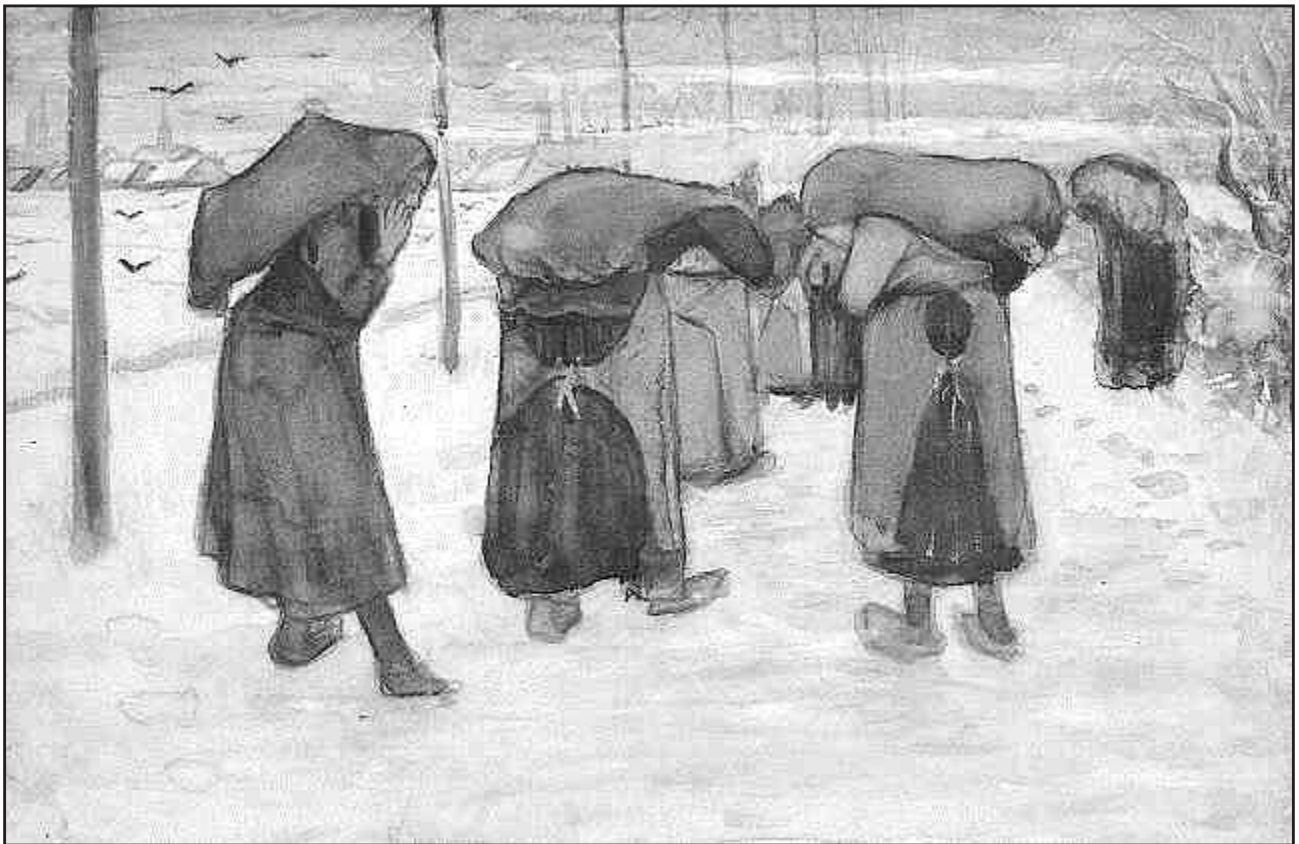
Women carrying sacks of coal in the snow, Vincent van Gogh, 1882

THE SIXTH SUNDAY AFTER PENTECOST JULY 9, 2023