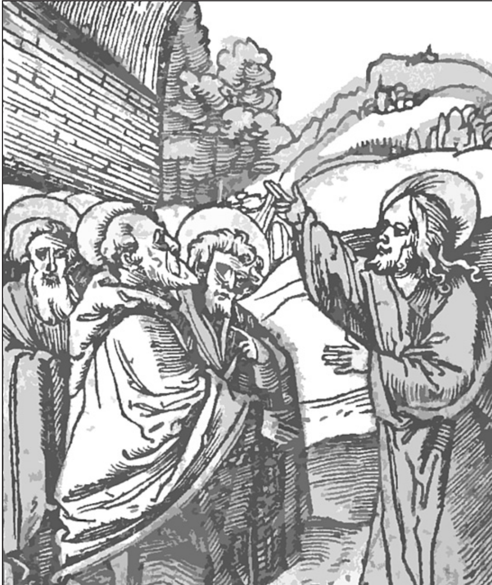
Christ Teaching the Disciples, Hans Schäufelein, 1517

THE THIRD SUNDAY AFTER PENTECOST JUNE 18, 2023