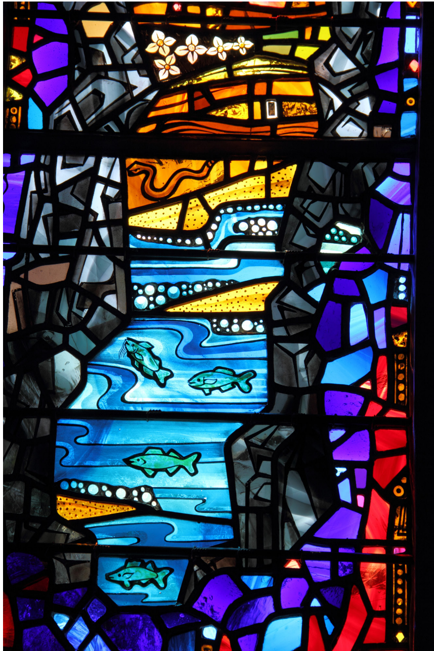
Beauty of Creation, Stained glass, Rowan LeCompte and Irene LeCompt, ca. 1972