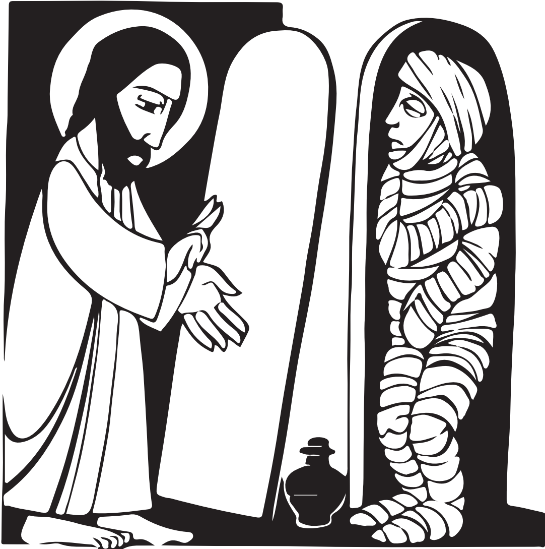
Jesus raises Lazarus from the dead