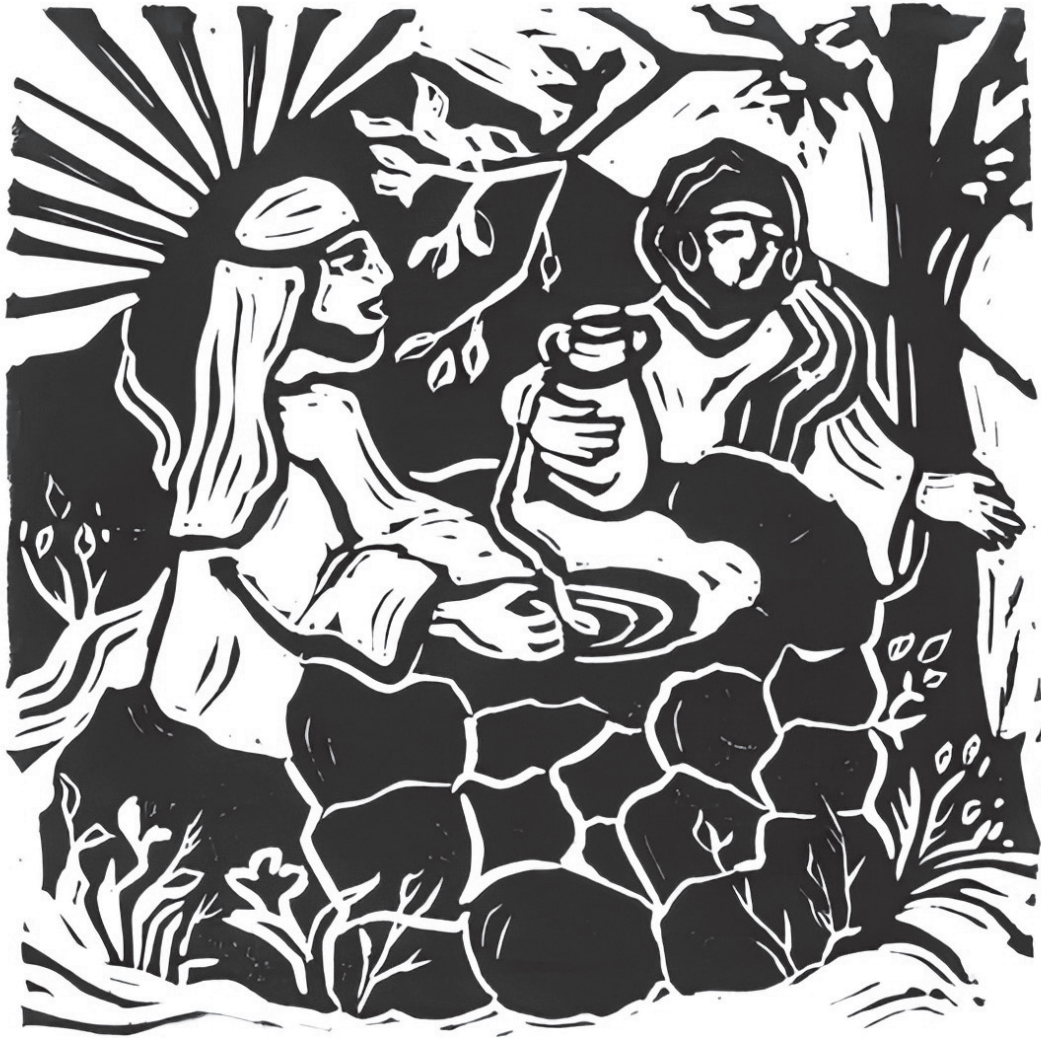
Woman at the Well, Cara B. Hochhalter, 2019