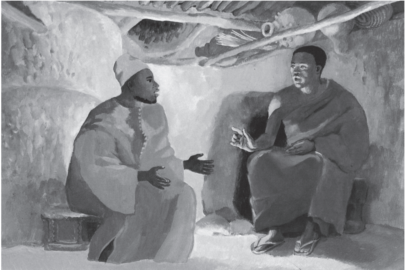
Nicodemus, Jesus Mafa, 1973