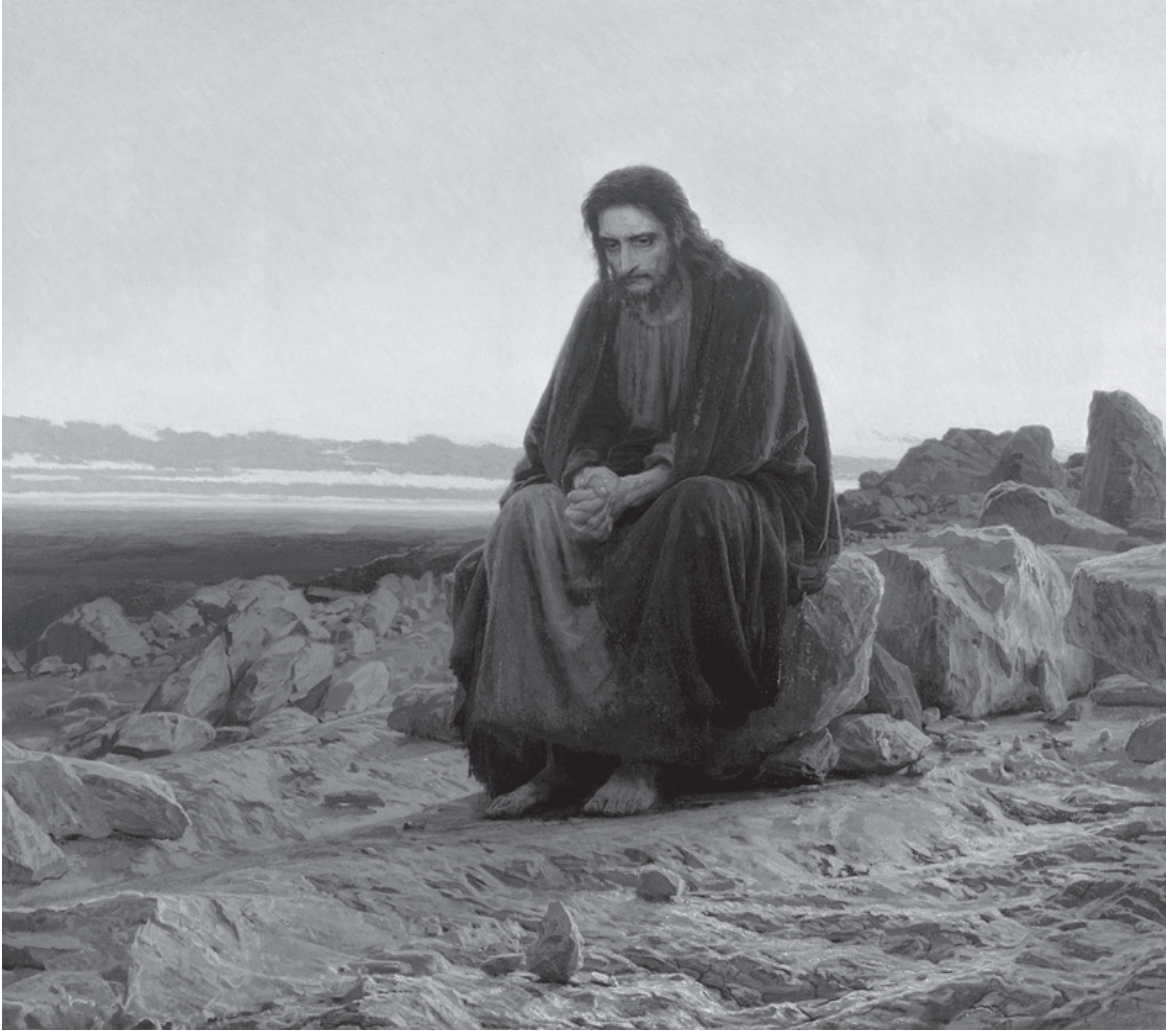
Christ in the Wilderness, Ivan Nikolaevich Kramsko, 1872

THE FIRST SUNDAY IN LENT FEBRUARY 26, 2023