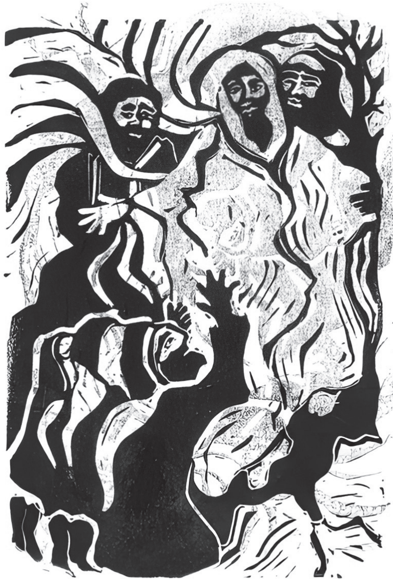
Transfiguration, Cara B. Hochhalter, 2019

THE LAST SUNDAY AFTER THE EPIPHANY FEBRUARY 19, 2023