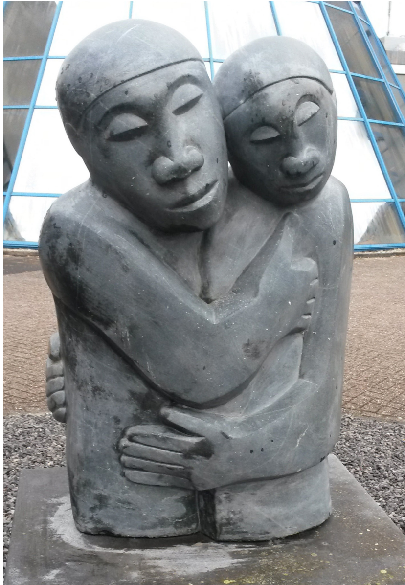
Reconciliation by Amos Supuni, sculpture in Woerden, 2015

THE SIXTH SUNDAY AFTER THE EPIPHANY FEBRUARY 12, 2023