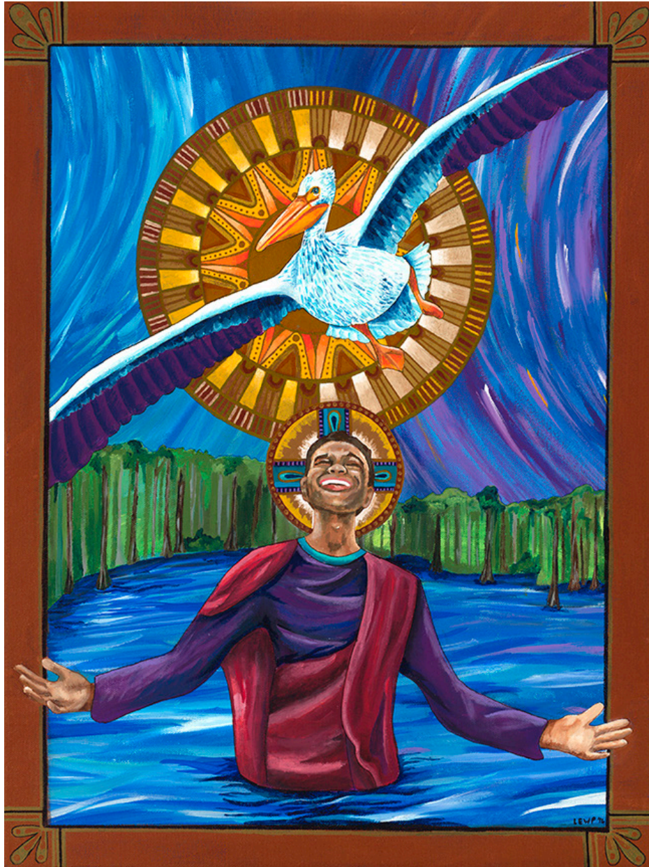
Bayou Baptism, Lauren Wright Pittman, 2016

FIRST SUNDAY AFTER THE EPIPHANY THE BAPTISM OF OUR LORD JANUARY 8, 2023